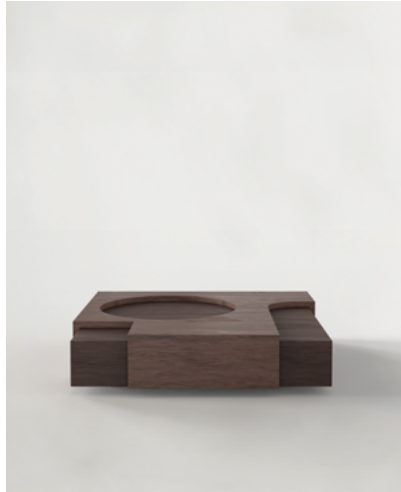
CIRCUS V2 — low table