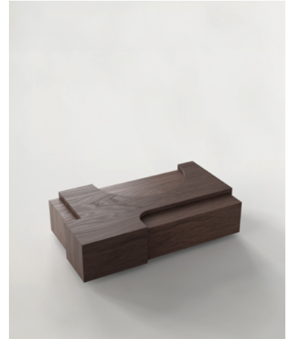
CIRCUS V3 — low table