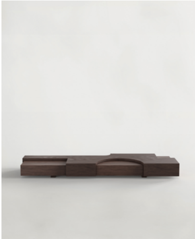
CIRCUS V1 — low table