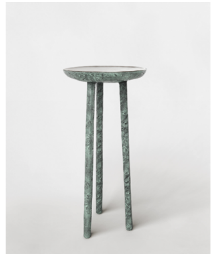
COMMA V3 — high stool