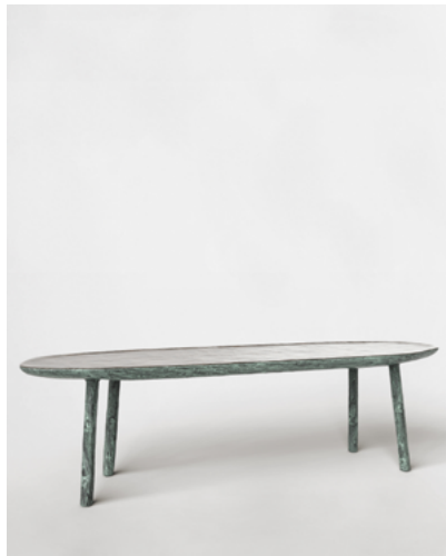
COMMA V2 — bench