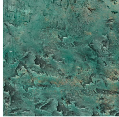
Green Patina Bronze