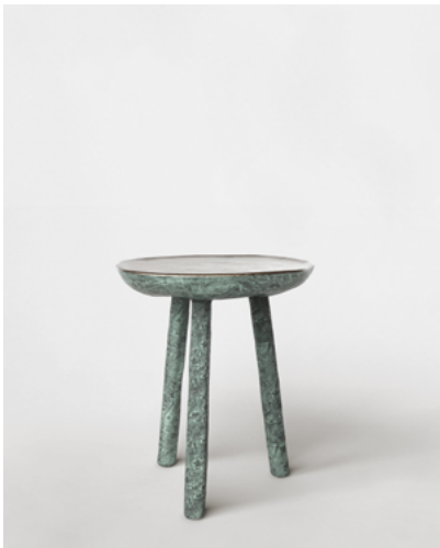
COMMA V1 — stool