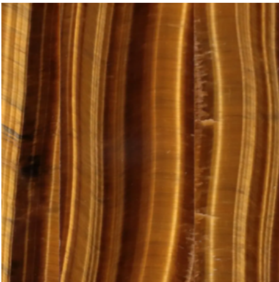
Tiger Eye Marble