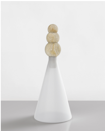
KITE V1 — bottle