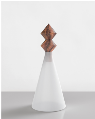
KITE V2 — bottle