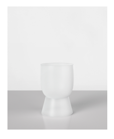
PIGALLE V1 — glass HxWxL 11.7x8.5 Ø cm 4.6x3.2 Ø " PG1_GL