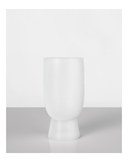
PIGALLE V2— glass HxWxL 15.6x8.5 Ø cm 11,8x3.2 Ø " PG2_GL