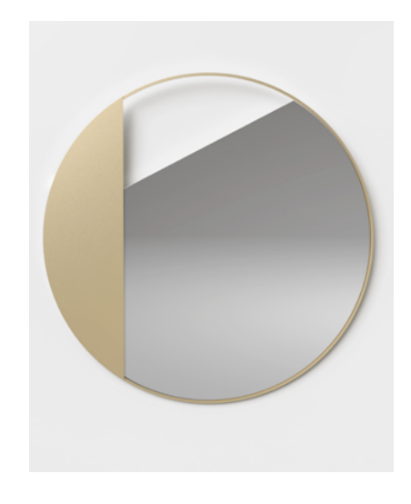
REVOLUTION V1 — wall mirror HxWxL 90 Ø / 4 cm 35,4 Ø/ 1.6 " RV1_BS_M90