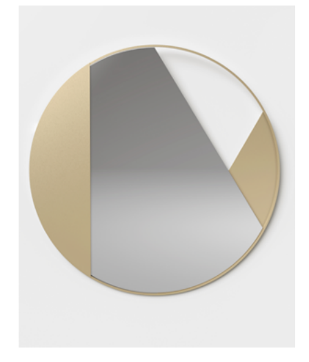
REVOLUTION V2 — wall mirror HxWxL 90 Ø / 4 cm 35,4 Ø/ 1.6" RV2_BS_M90