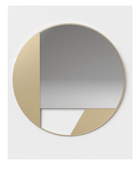
REVOLUTION V3 — wall mirror HxWxL90 Ø / 4 cm 35,4 Ø/ 1.6 " RV3_BS_M90