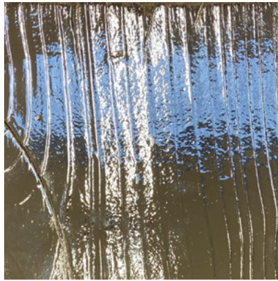
Cold liquid silver finish on solid wood