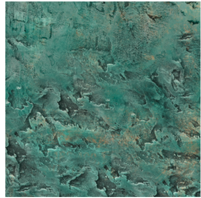
Green Patina Bronze