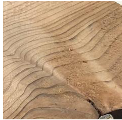
Solid Ash Wood