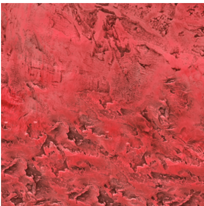
Red Patina Bronze