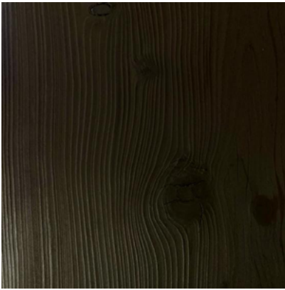
Charred Cedar Wood