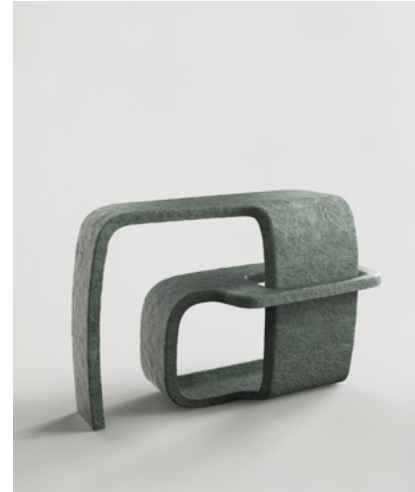
VERTIGO V3 — console