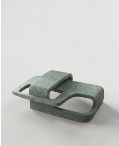
VERTIGO V1 — low table