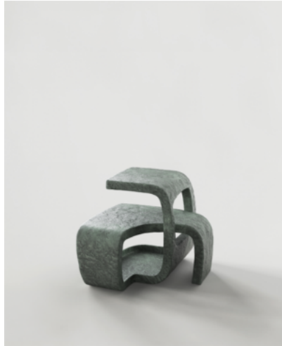
VERTIGO V2 — side table