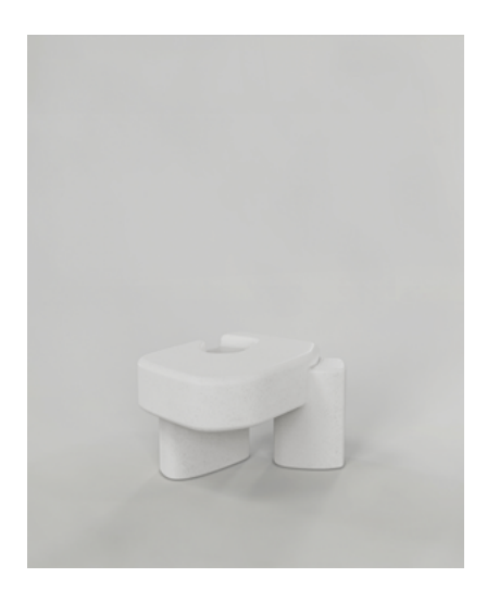
VOID V3 — low table LxWxH 58x43x37cm 22.8x16.9x14.6 " COD:: VD3_PS