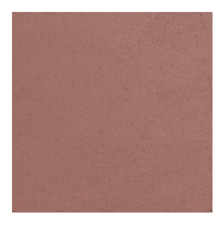
Terracotta Finish Polistyrene Comparative reference: RAL 3016