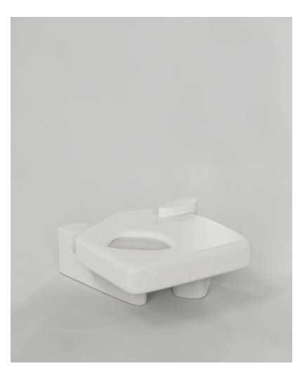
VOID V2 — low table LxWxH 100x100x45cm 39.4x39.4x17.7" COD:: VD2 PS