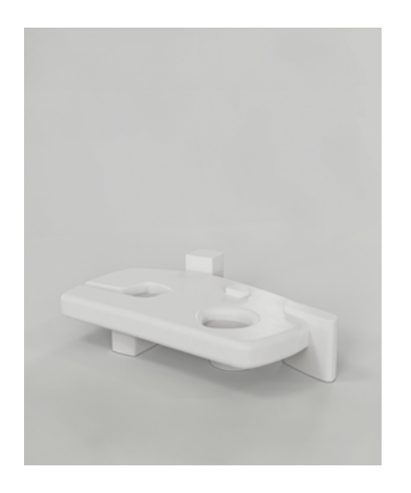
VOID V1 — low table LxWxH 175x113x42cm 66.9x44.5x16.5" COD:: VD1_PS

LIMITED EDITION OF: 15+3 AP EXCLUSIVITY AGREEMENT: YES