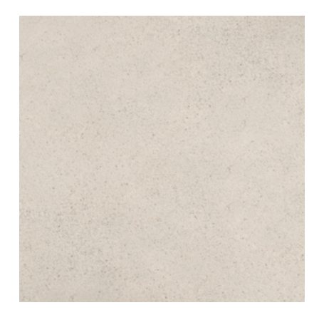
Cream Finish Polistyrene Comparative reference: RAL 9001