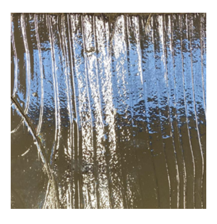
Cold liquid silver finish on solid wood