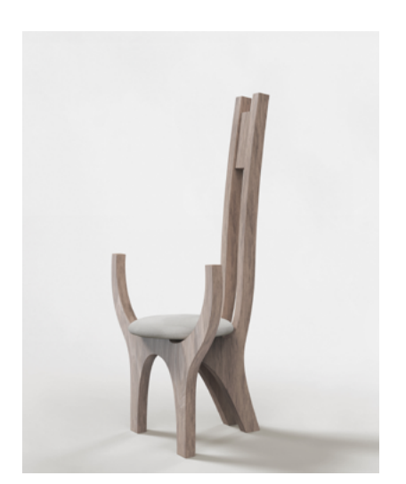
ZERO V2 — chair HxWxL 130x43x73 cm 51.2x16.9x28.7 " ZR2_W_F