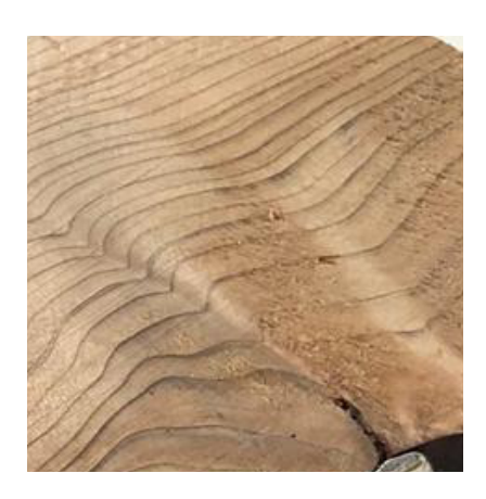
Solid Ash Wood