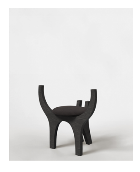
ZERO V1 — chair HxWxL 67x43x73 cm 26.3x16.9x28.7 " ZR1_W_F

LIMITED EDITION OF: 15+3 AP EXCLUSIVITY AGREEMENT: NO